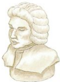
Johann Sebastian Bach 1685-1750